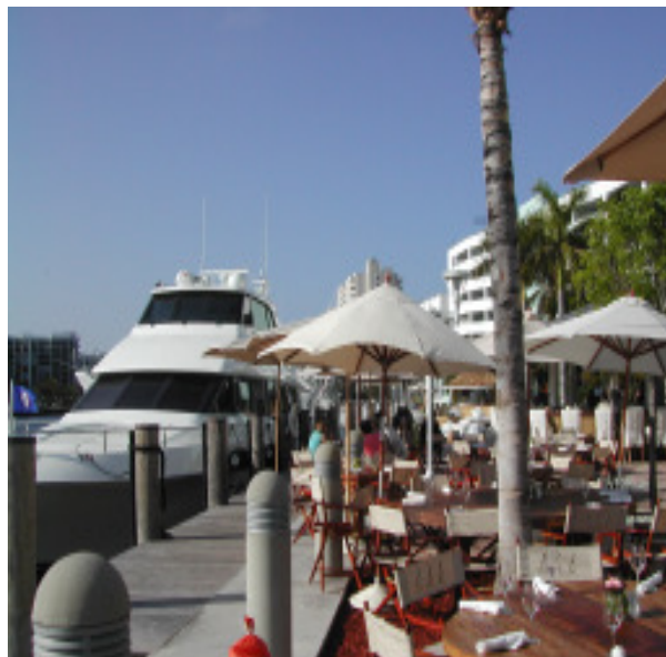
The Diplomat Oceanfront Residences , adjacent to The Westin Diplomat Resort • The Diplomat Landing , spectacular yachts & social life