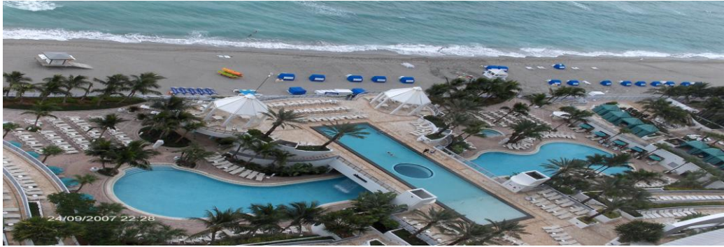
Westin Diplomat Resort – pool deck & beach