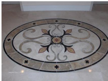
private elevator lobby